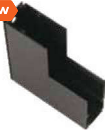
Surface L Shape Vertical Connector