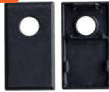
End Cap-Trimless Track Rail