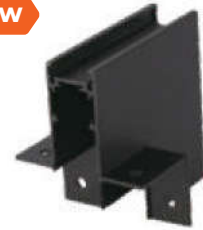
Trimless L Shape Vertical Connector