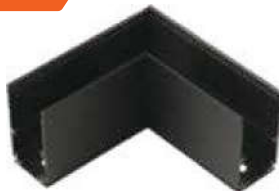
Surface L Shape Side Connector