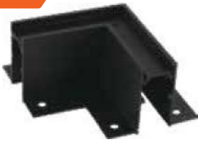
Trimless L Shape Side Connector