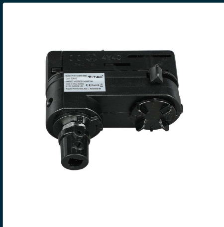
4 wired y series c adaptor black SKU 3660 EAN 3800157619158