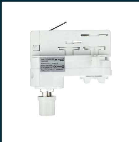
4 wired y series c adaptor white SKU 3659 EAN 3800157619141